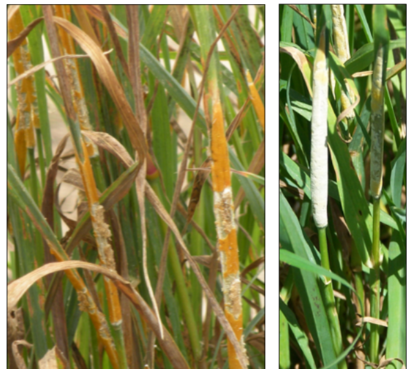
Figure 4. Choke disease, caused by Epichloë typhina , on an orchardgrass plant in western Oregon. Fungal hyphae are orange or white and are usually found on stems in the lower part of the plant prior to full seed development.

Rather than being seed transmitted, this endophyte reproduces sexually. There is no known host resistance, and fungicide treatments have not been effective.