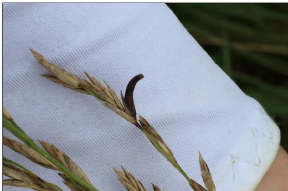
Figure 3. Ergot on a tall fescue plant infected by Claviceps purpurea .

Endophytes are not the only fungal species that produce ergot alkaloids. In some cases, livestock toxicity is caused by the fungus Claviceps purpurea , which can produce sclerotia (also known as ergot) in the seed of many grass species (Figure 3). These ergots are full of ergopeptines (toxic alkaloids similar to ergovaline), which are highly toxic to livestock. Seed and seed screenings contaminated with ergots sometimes contain high concentrations of ergopeptines.