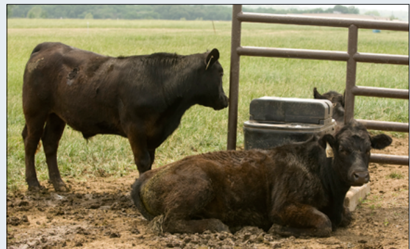
Figure 5. Signs of fescue toxicosis in cattle that have grazed toxic tall fescue. Animals have low average daily gains and rough hair coats. They are muddy due to a preference for wallowing near the water trough.

Fescue foot. This disorder is characterized by dry, dead (gangrenous) tissue in the extremities, lameness, and swelling in the legs. After 2 or more weeks, animals develop sloughing of the hooves or lose the tips of their tail or ears. In the winter, frostbite can occur. A 10- to 20-day period of feeding on toxic endophyte-infected tall fescue or its by-products is required before clinical signs appear. In the Pacific Northwest, fescue foot has occurred sporadically in cattle and sheep during the winter.