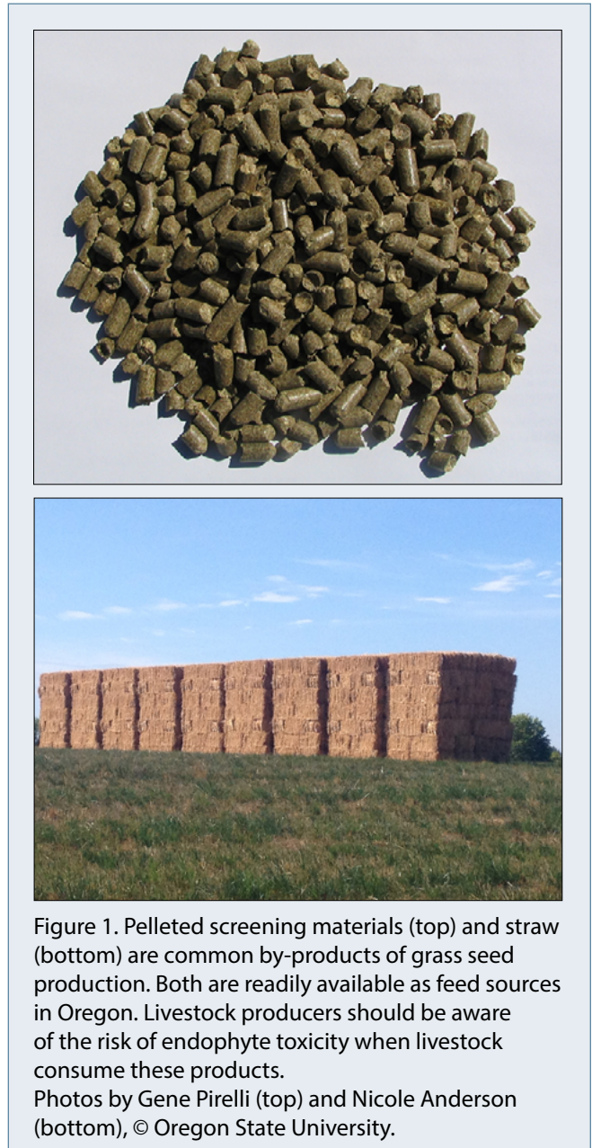
Figure 1. Pelleted screening materials (top) and straw (bottom) are common by-products of grass seed production. Both are readily available as feed sources in Oregon. Livestock producers should be aware of the risk of endophyte toxicity when livestock consume these products.

Endophytic fungi are associated with both forage and turf types of tall fescue ( Schedonorus phoenix [Scop.] Holub) and perennial ryegrass ( Lolium perenne L.) These fungi are from the